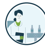
Food and Beverage Processing Workers