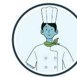
Chefs and Cooks

Higher risk of COVID-19 may be due to indoor, in-person operations, with close physical proximity and frequent contact with others.