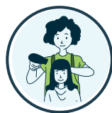
Personal Services Workers