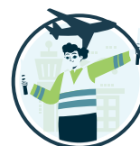
Air Transport Workers