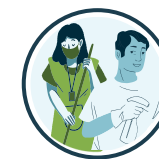
Janitors and Cleaners