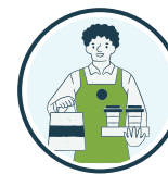
Food and Beverage Preparation Workers